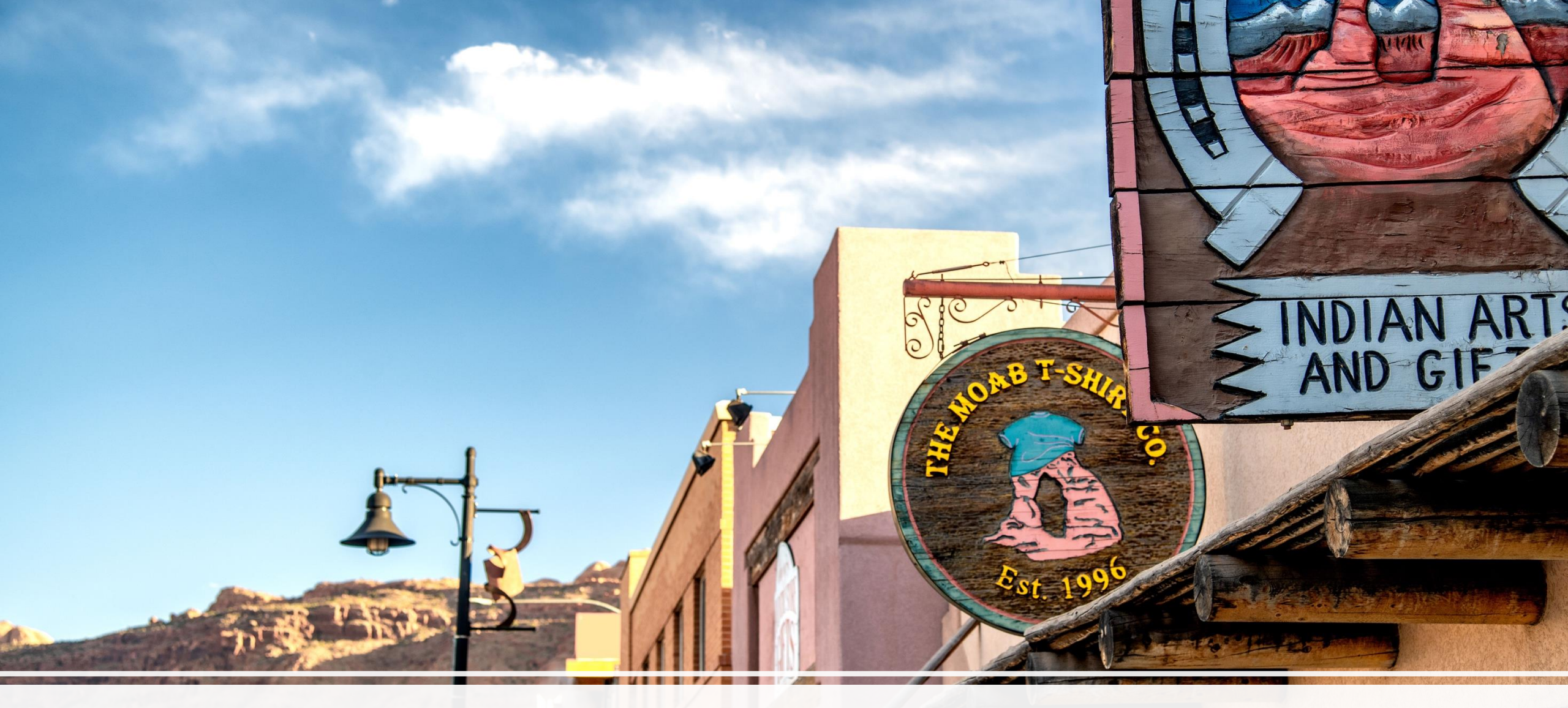
Downtown Moab, Utah