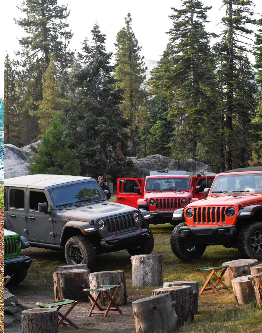
Rubicon Springs Base Camp